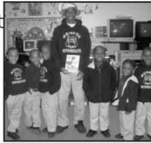
K-1 Enjoys Read Across Alabama Day